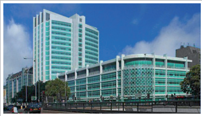
Figure 5: University College London Hospitals.

Andrology operations were mostly performed in 3 or 4 of that theatres for each day.