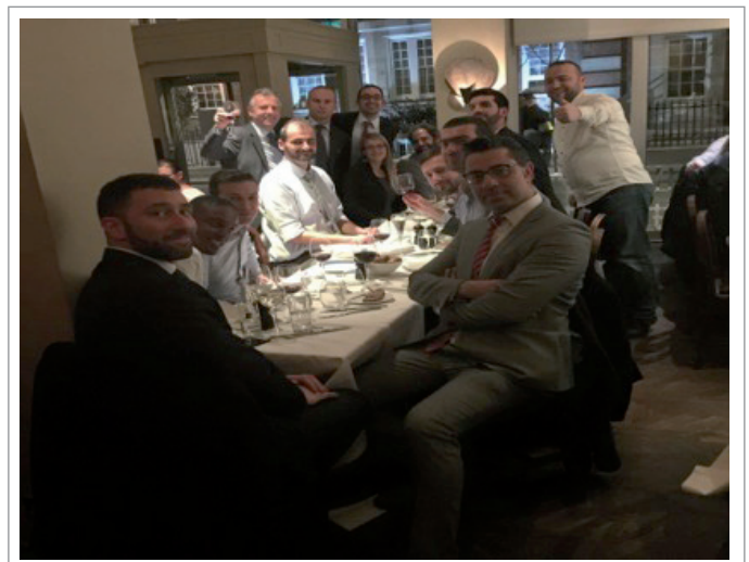
Figure 4: Faculty dinner of the Men's Health Masterclass.

For each week, on thursday afternoons, there were meetings to view the weekly surgical programme and the cases of the week. These meetings helped me to understand the concept of surgical operations so that I had chance to read about that