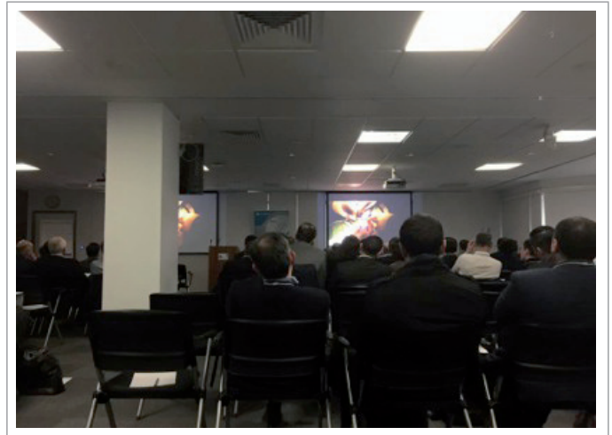
Figure 3: 3 rd Men's Health Masterclass.

During my clinical visit, i had chance to attend the 3 rd Men's Health Masterclass(21-22 April 2016). The conference was fully scientific, well-designed and a fruitful conference with lots of live surgeries and lectures by senior mentors. Step-by-step surgical procedures for penile prosthesis implantation, penile plication, Lue procedure, sliding technique etc.