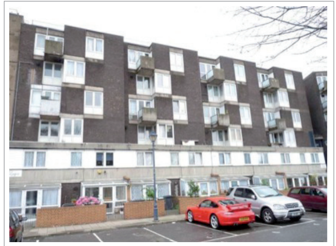
Figure 6: My house in East London.

I was living in East London, Bow, nearby one of the most famous markets, Roman Market. I was using the public transport and the public transport is extremely great in London. The only handicap of London is its expensiveness. Everything is more expensive when comparing other European cities.